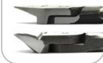
NY10S - Double-Acting, High-Precision Sliding Nipper

Order Blades Separately See page 932–933